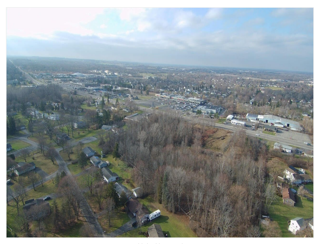
sith looking south